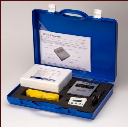
Delvotest® Milk Antibiotic Testing Kit