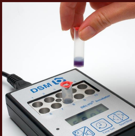
Read sample after recommended time