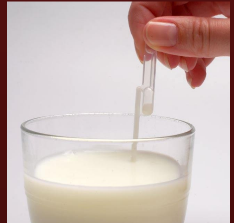
Take milk sample using pipette