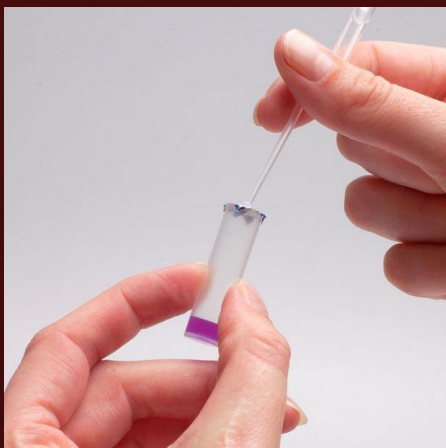
Deposit milk from the syringe into Ampoule