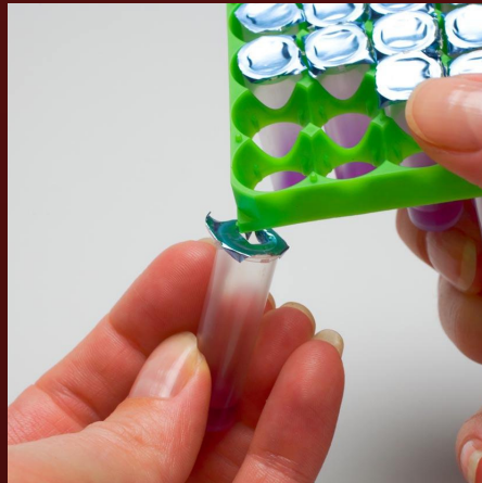
Break open using corner of Ampoule